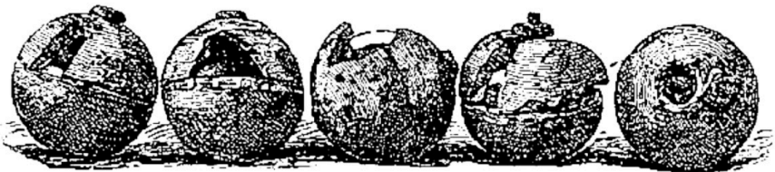
3. Bombs used in evidence, after analysis by chemists.